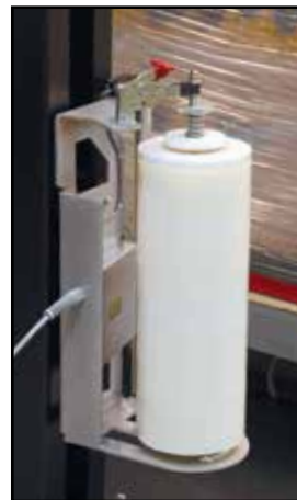
"Quick Change" Film Mandrel