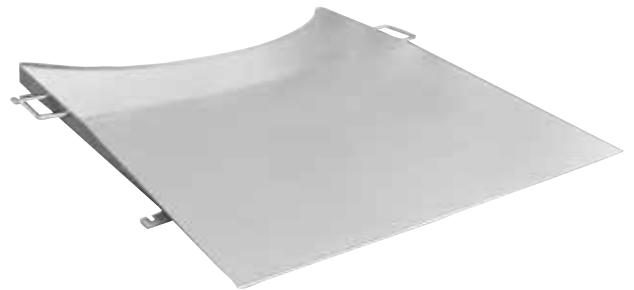
Variety of Access Ramps Available